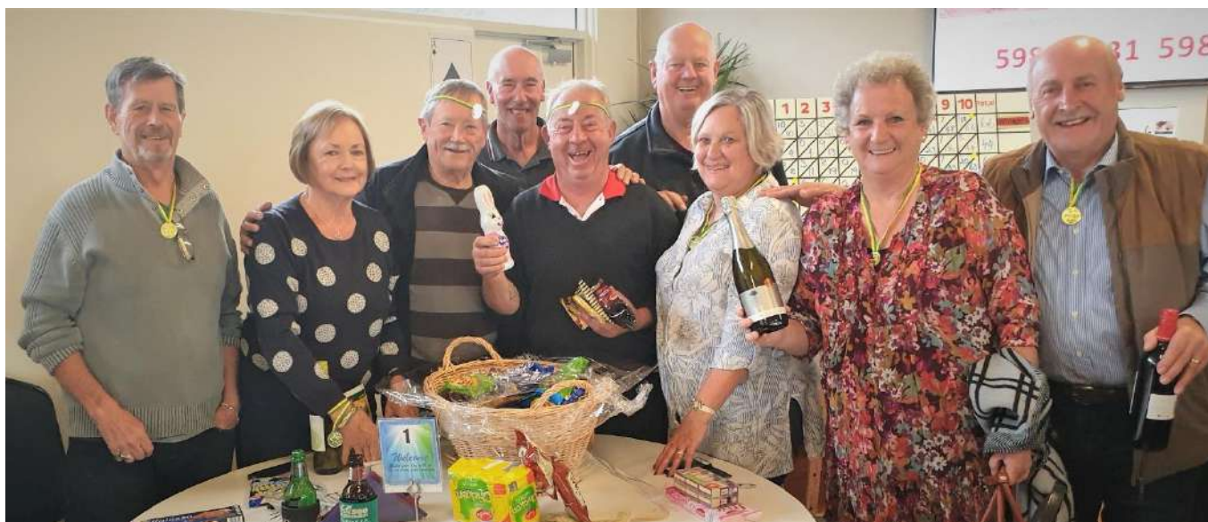
"Wooden Spooners" team. Winners are grinners