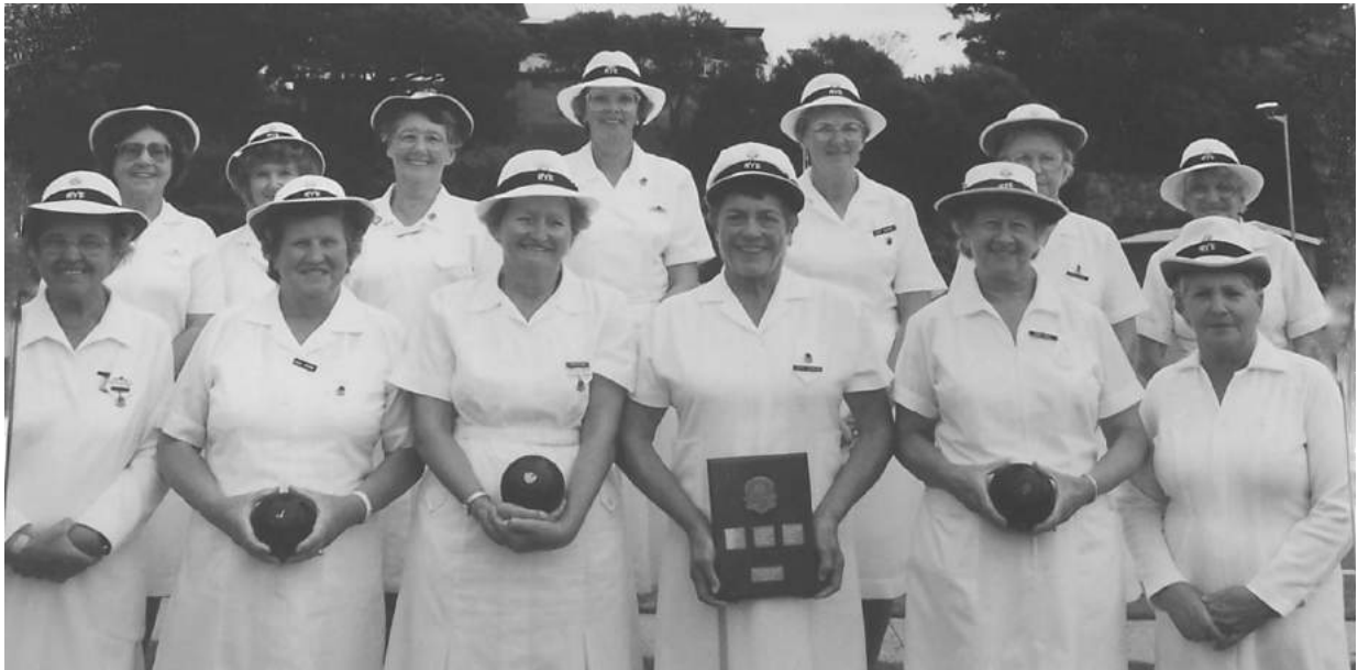
FDLBA Div.4 Premiers1990/91