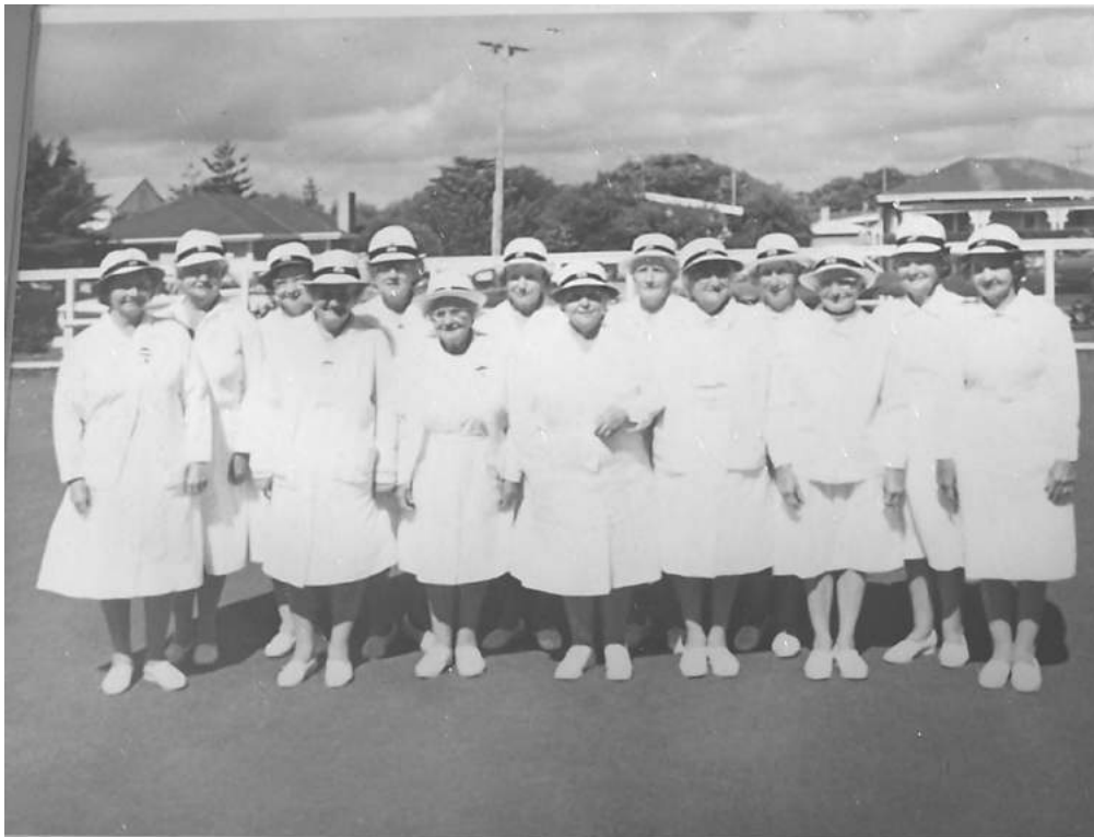
A Division Runner up 1973-74