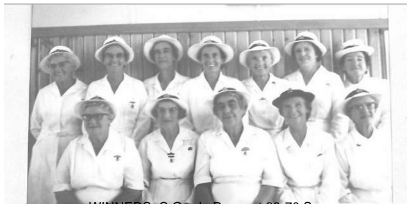
WINNERS; C Grade Pennant 69-70 Season.