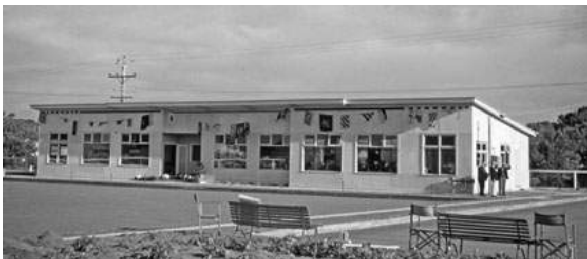
The Ladies First Opening Day 20 th . September 1960

Also, at this meeting, the Constitution and Rules as submitted were adopted.