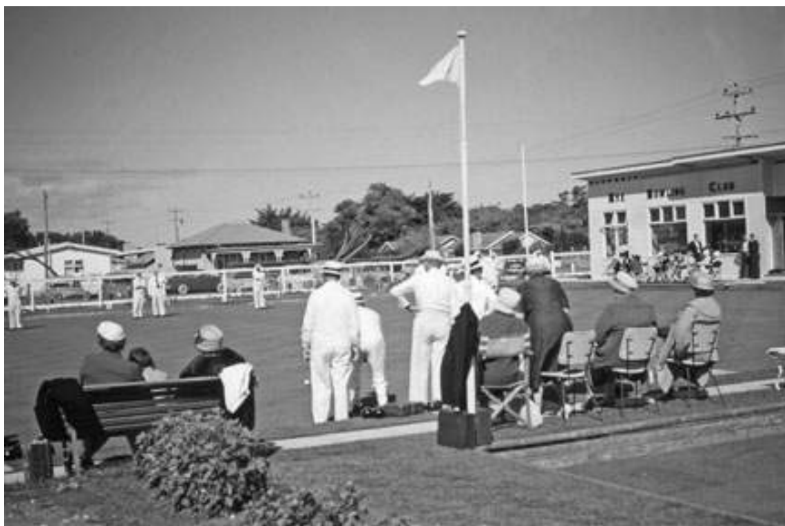
OPENING DAY SEPTEMBER 1961-62 Season