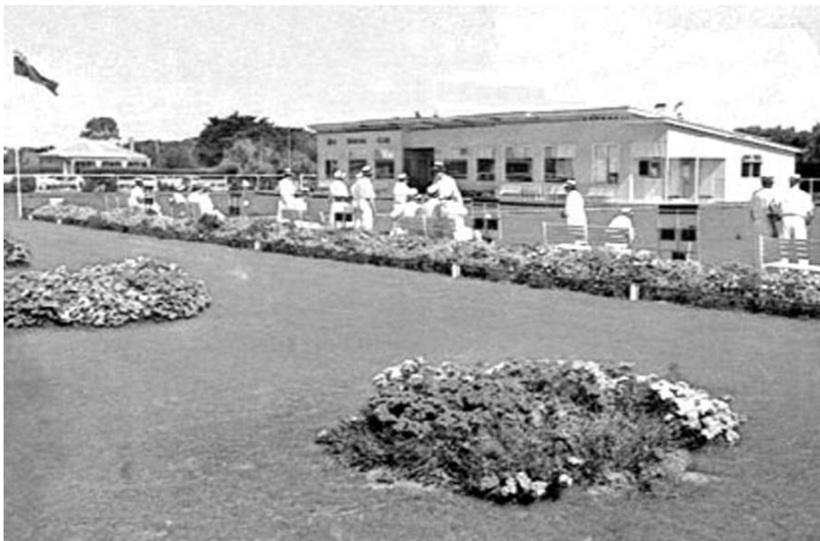
VIEW FROM NAN TAYLOR GREEN IN 1970 (When it was a garden)