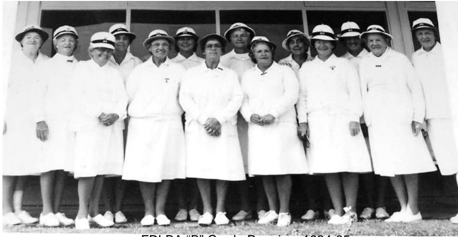
FDLBA "B" Grade Premiers 1984-85