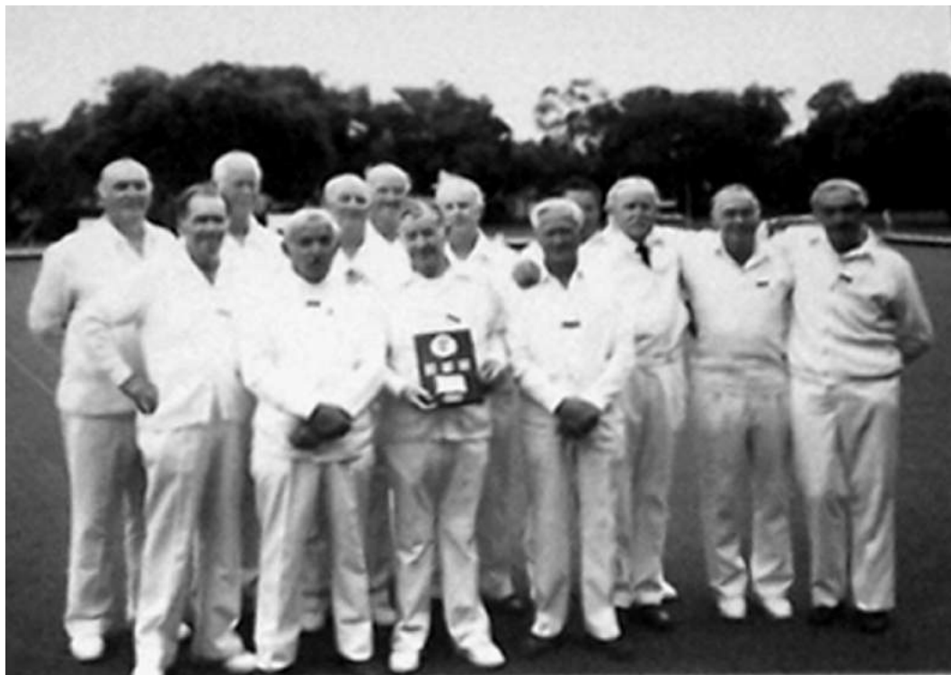
FBA Division 3 Premiers 1984-85

In order to proceed with the required extensive alterations it was put to a Special General meeting on the 7 th . May 1982, that a Rye Bowls Club Co-operative must be formed and that all Full and Associate members would be required to take out a $100.00 debenture. The Committee also recommended the scrapping of the existing Constitution and a new one written on the basis of the RVBA model with some local modifications. All this was ratified at a further General Meeting held on the 14 th . May 1982. It was also approved at this meeting that "In future all reference to Associate Members will be replaced by the term Lady Members."