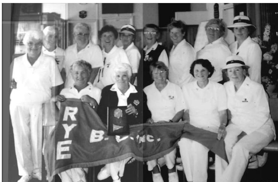
2002/2003 FDLBA Division 3 PREMIERS