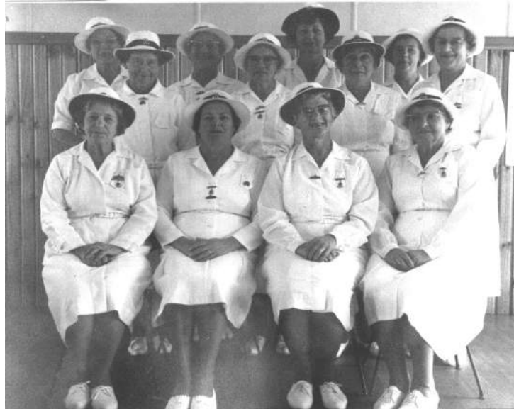
WINNERS "B" Grade Pennant 1969

As mentioned earlier, the women of the Club formed Rye Bowls Club Ladies Committee on December 8 th . 1958 and did much to assist the men in creating the Club from nothing. From the word go they raised money by any means they could devise. Over the years this group was variously called "The Ladies Committee" "Ladies Associates", "Rye Ladies Bowling Club" more recently the "Ladies Bowls Section ". At the time of writing it is known as the VLBA Affiliated Section of Rye Bowls Club Inc. The ladies had limited Club rights: They were not able to be elected to the General Committee; their numbers were limited to 50 which were later increased to 100 when a provisional list was introduced as a waiting list. At this time the men were also limited to 100 as the Greens Director was concerned about the amount of traffic in a very dry season of 1977/78. Meantime the Ladies ran their own affairs except if they wanted money to purchase anything they had to apply to the General Committee and on a monthly basis had to relinquish surplus moneys.