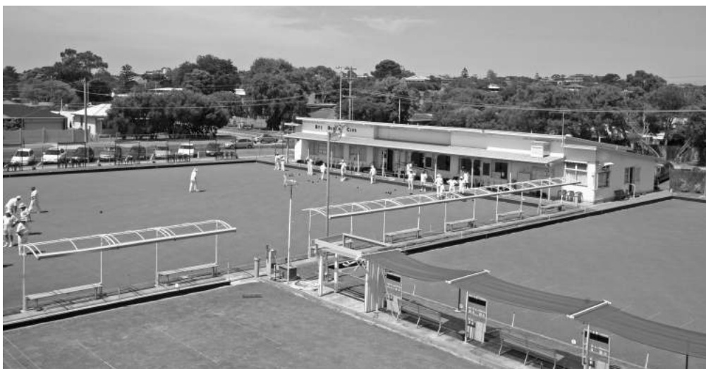
View in March 2007 from the Nan Taylor Green.(foreground)

Note; Nan Taylor Green is a practice Green not a garden, Sunshades around all of the perimeter, the verandah & changes to the western end of the Clubhouse.