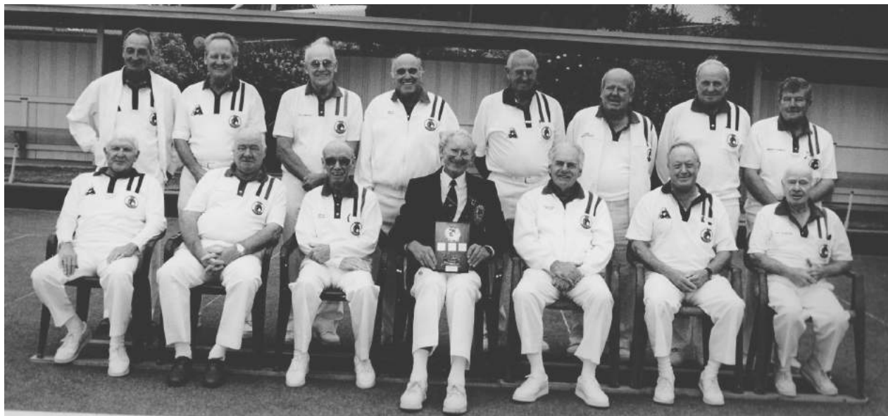
F.B.A. PREMIERS Div 4 2000/01

Incredible as this seems, good numbers sustained at a total of approximately 365 for the rest of 1991 but began to decline to 302 in October 1993 and approximately 250 total in 1996 which was sustained for 4-5 years at 150 Men and 100 Ladies. Often losing 20 to thirty members but replacing them with new ones. Male members have dropped to around the 100 mark in recent years and the females to around 50.